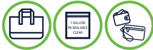
CLEAR TOTE 12" X 12" X 6"