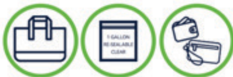
CLEAR TOTE 12" X 12" X 6"