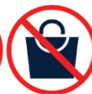
FANNY PACK MESH BAG OVERSIZED TOTE PATTERNED