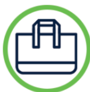
CLEAR TOTE 12" X 12" X 6"