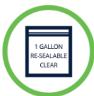
PLASTIC ZIP TOP BAG 11" X 11" X 0"