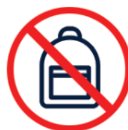
BACKPACK BINOCULARS CASE CAMERA CASE CLEAR BACKPACK