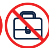
STRING BAG BRIEF CASE TINTED PLASTIC BAG ROLLER BAG