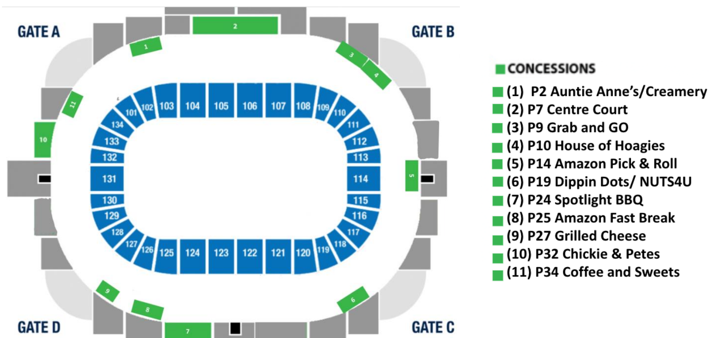
Diagram of Concessions Stands

Concessions stands will open on the concourse starting at 4PM Friday and will close between 12PM and 4PM on Sunday. The location of each stand is noted in the diagram depicted below. Gluten-free options will be provided at the “Amazon Fast Break” and “Amazon Pick & Roll” stands. Additionally, all stands are accessible via a lowered counter on the far left or far right of each stand. There are also various water fountains around the concourse, so it is encouraged for attendees bring their own reusable bottle.