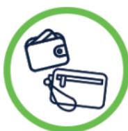
WALLET/CLUTCH 6.5" X 4.5"